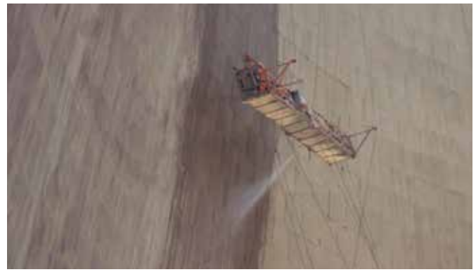
Pre-wetting the surface and application of KÖSTER NB 1 Grey in one step.