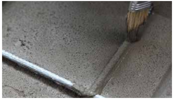
Application of KÖSTER Z1 / Z2 as a mineral corrosion protection.