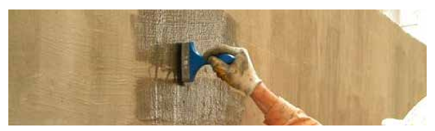
The well mixed material is spread evenly using a brush or roller.

between + 10 °C and + 25 °C for a minimum of three minutes until a homogeneous consistency is achieved. That will guarantee a sufficient pot life. During mixing, repot the material to avoid mixing errors. KÖSTER Polysil TG 500 2C is an extremely durable coating and after application, the final finished surface has a uniform, clearly defined dark glossy surface.