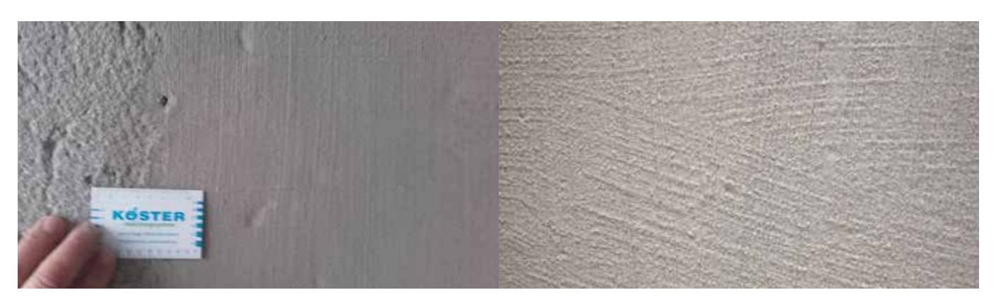
The material should be brushed vertically and horizontally to work it into the substrate.