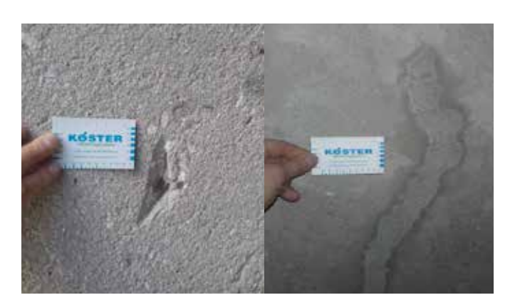
Exposed reinforcement must be cut back and covered with KÖSTER Repair Mortar NC.

Careful preparation is important in order to obtain a stable substrate that ensures high quality and durability of the waterproofing.