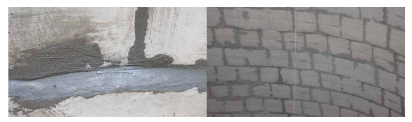
The surface is leveled using KÖSTER Repair Mortar NC. Holes and voids bigger than 5 mm have to be closed and filled with KÖSTER Repair Mortar NC.