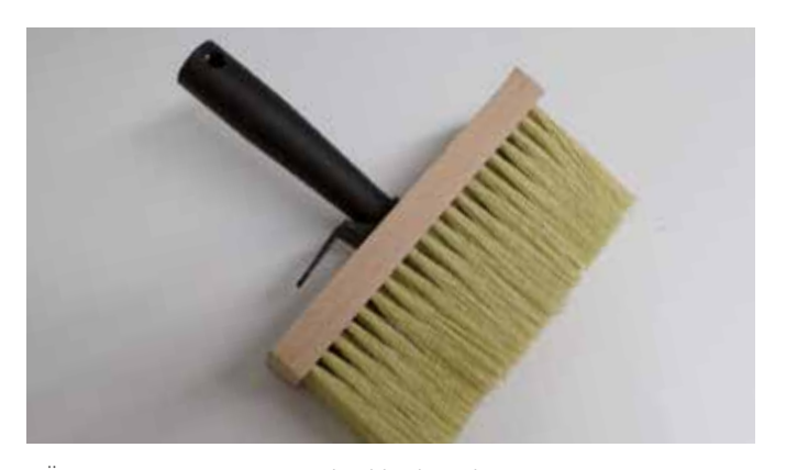
KÖSTER NB 1 Grey is applied by brush.

The second layer is applied when the first layer is cured well enough so that it is not damaged by brushing. The surface is kept moist over the following three days to avoid premature drying out of the coating.