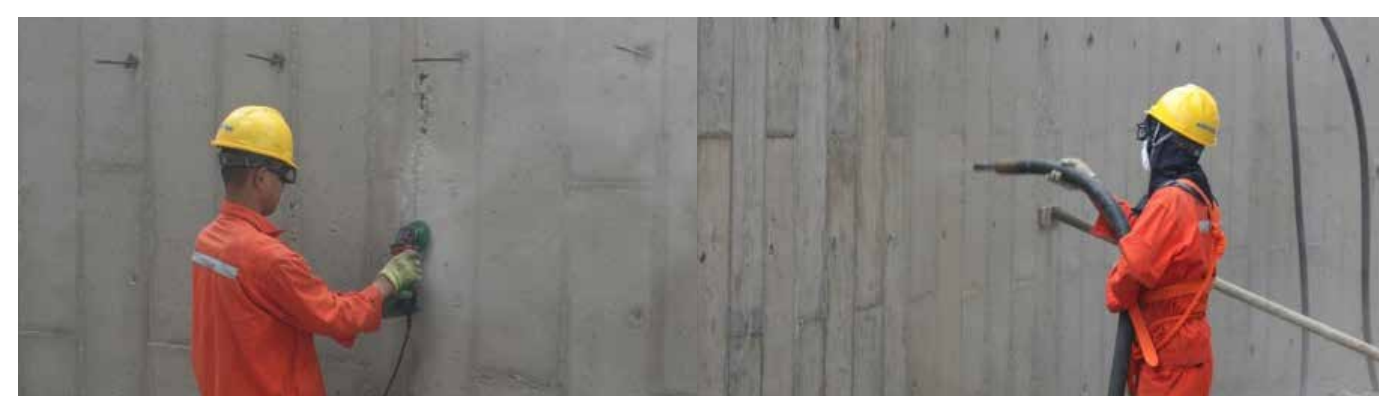
The mineral substrate has to be sound and solid as well as free of bond inhibiting agents. The surface is prepared by sandblasting.

All cracks, rough surfaces, voids, irregularities, and breakouts with a surface roughness greater than 5 mm must be evened out with KÖSTER Repair Mortar NC.